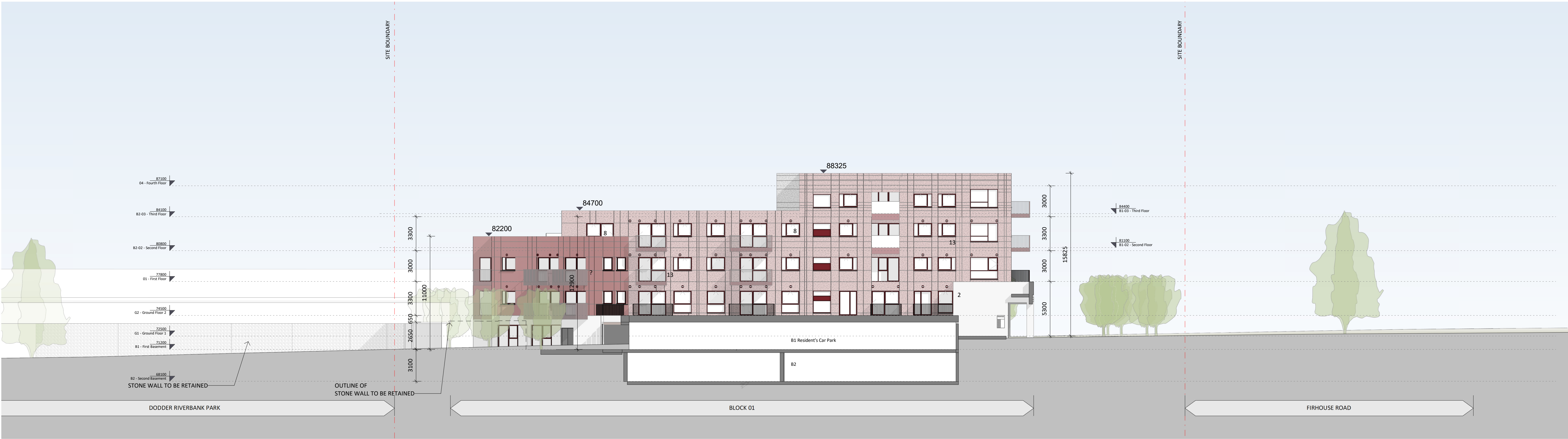
5 Proposed Elevation 05 - Block A Podium 1 : 200