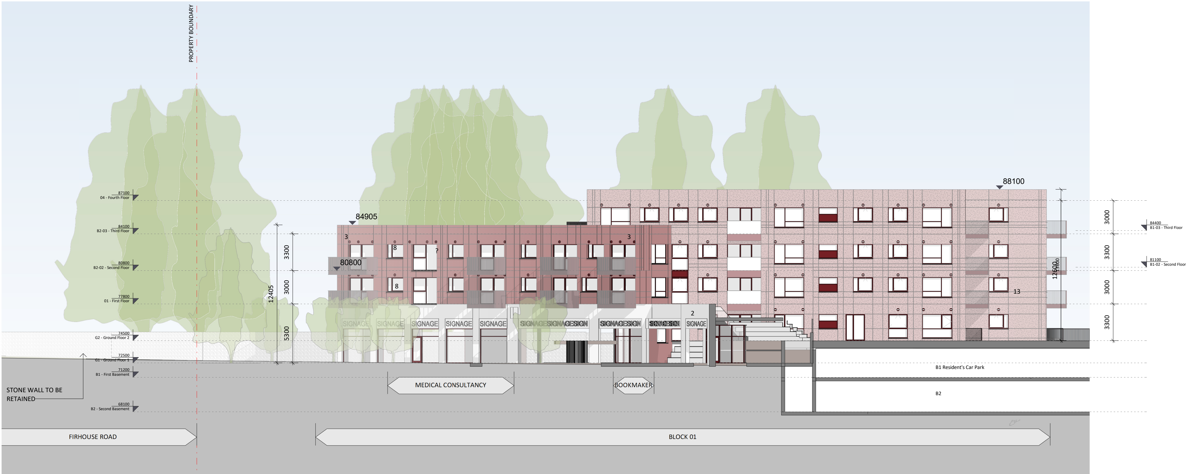
6 Proposed Elevation 06 - Block B Podium 1 : 200