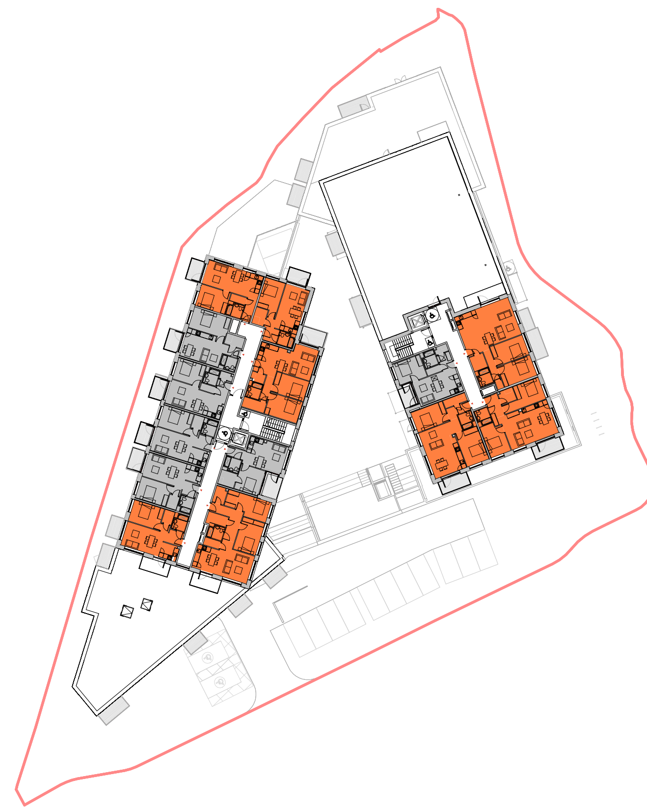
6 DA-03 1 : 500