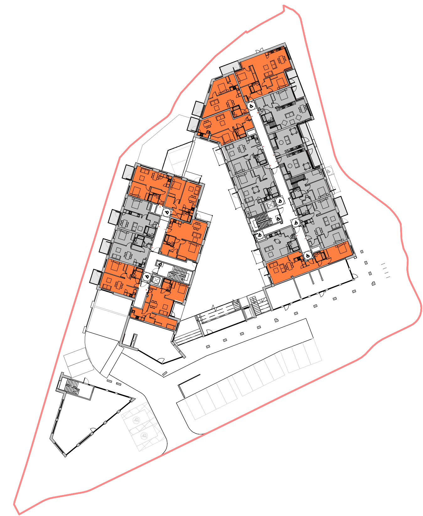
2 DA-00 1 : 500