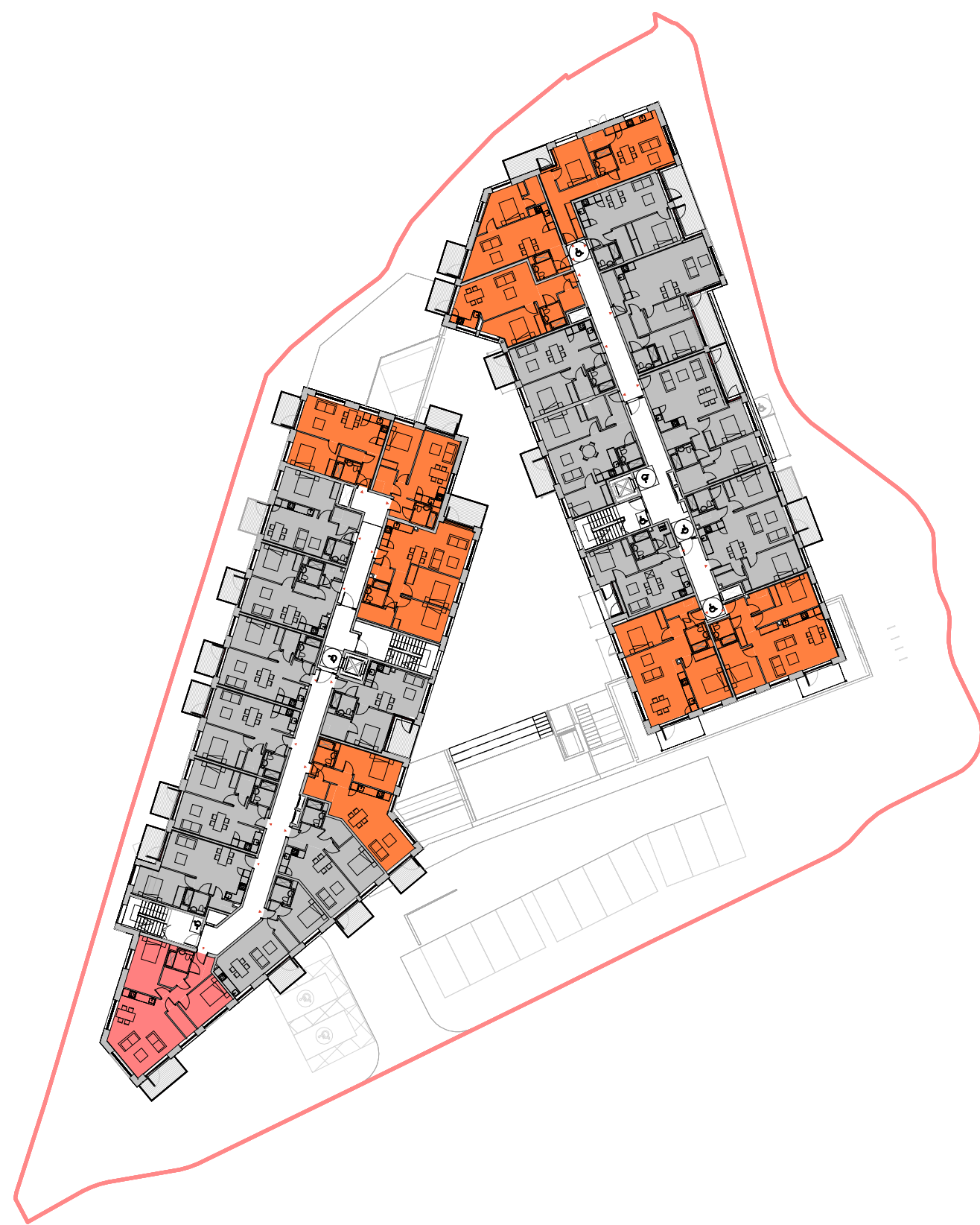
3 DA-01 1 : 500