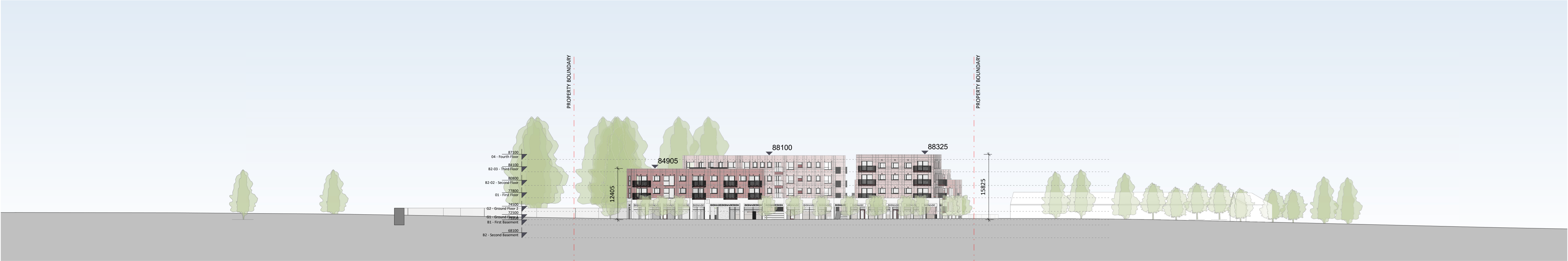
Contiguous Proposed Elevation 01 - Firhouse Road (South) 1:500