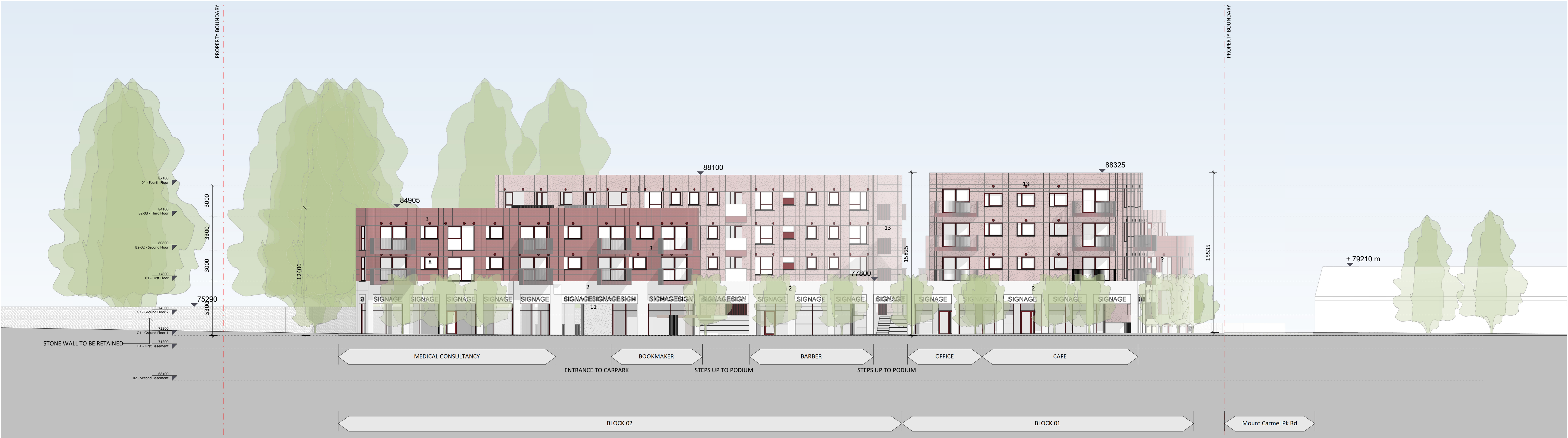
Proposed Elevation 01 - Firhouse Road (South) 1:200