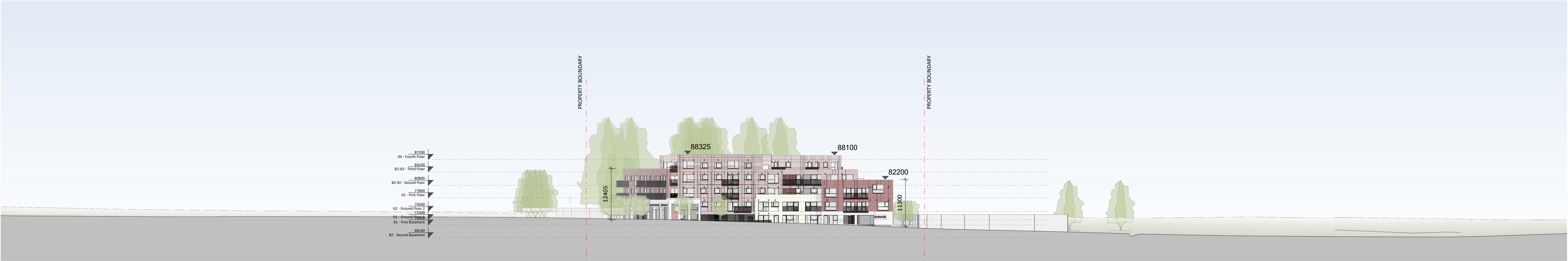
Contiguous Proposed Elevation 02 - Mount Carmel Pk Road (East) 2a 1:500