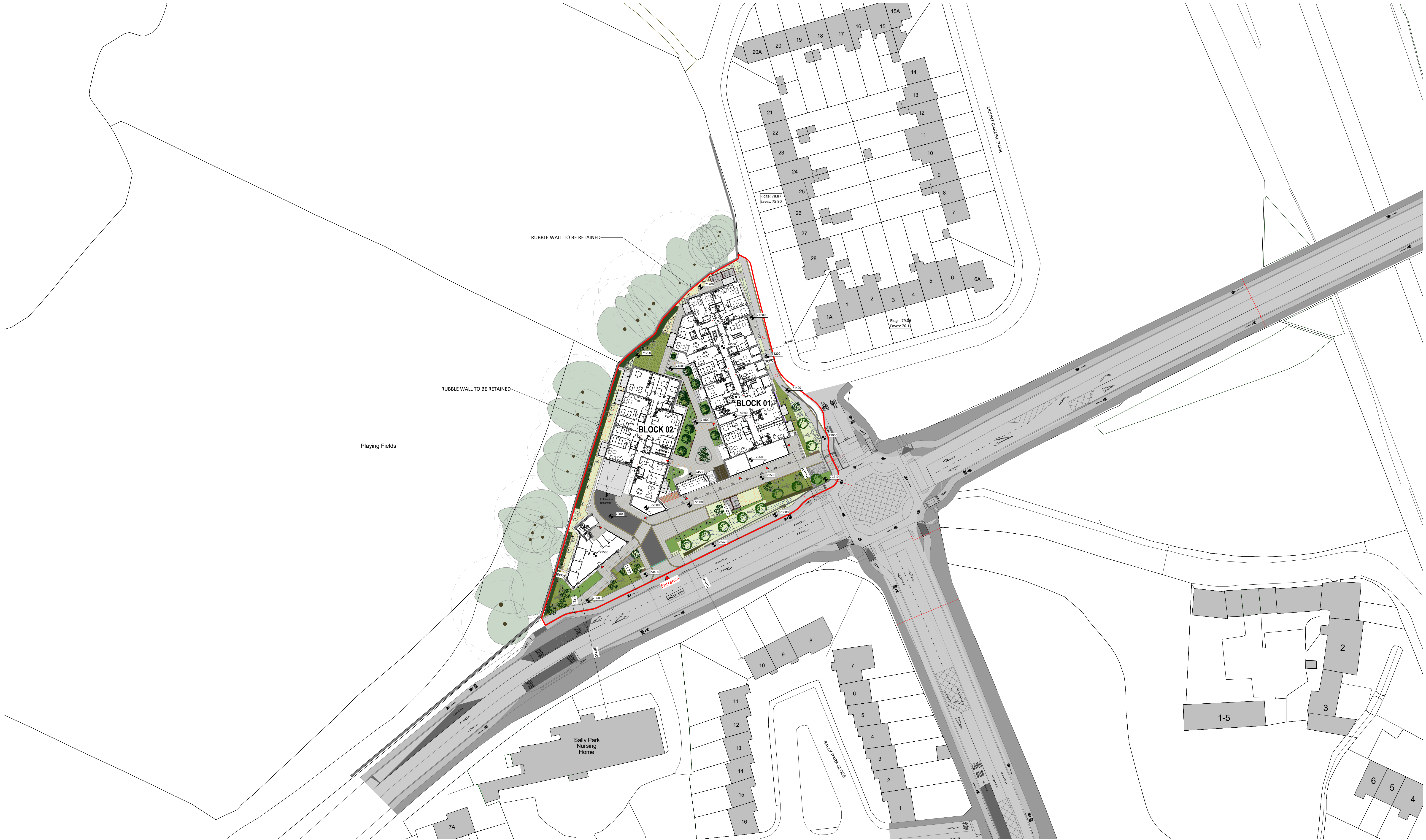
Permitted Site Layout Plan