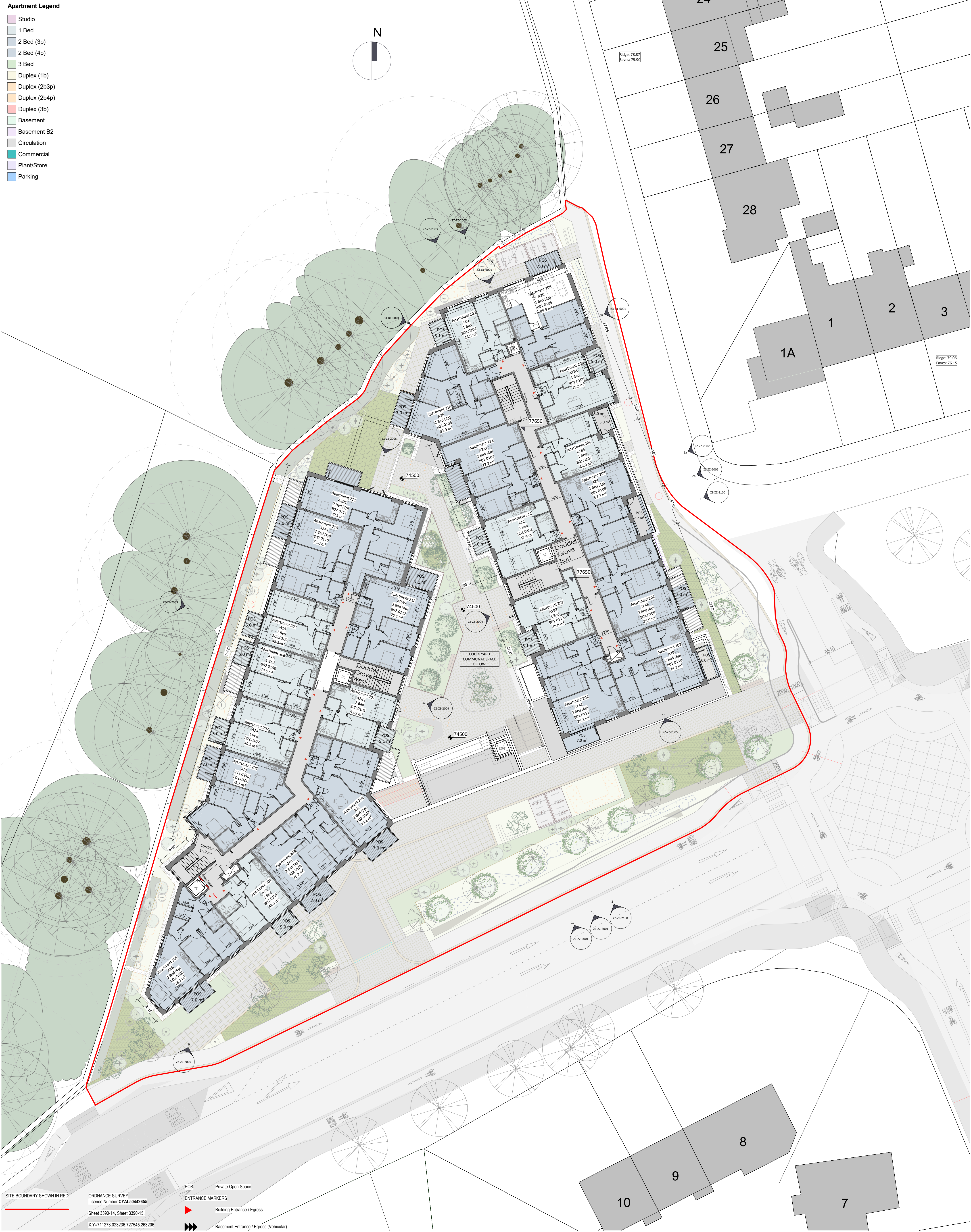
Permitted GA Plan - Level 01