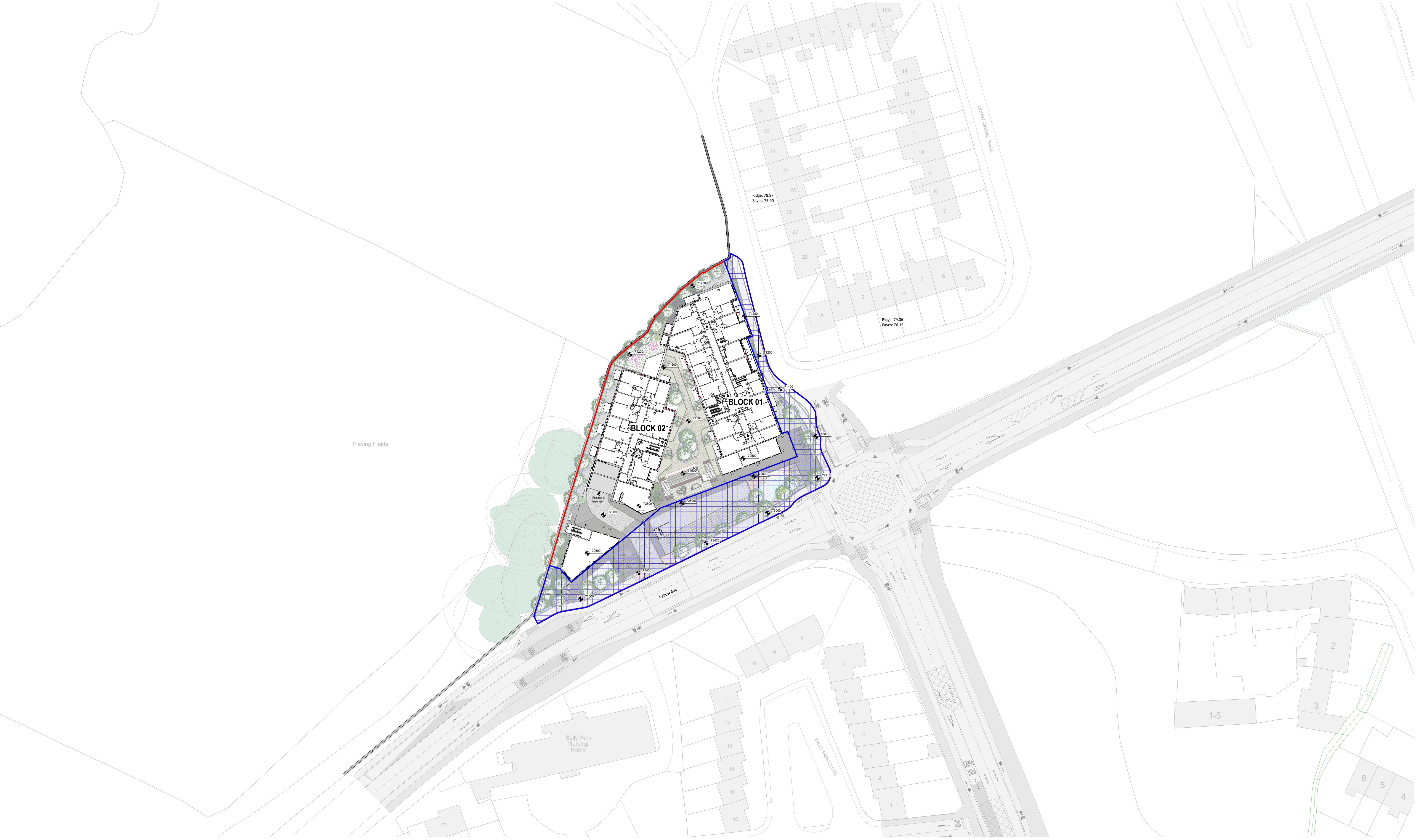
Proposed Taken in Charge Plan