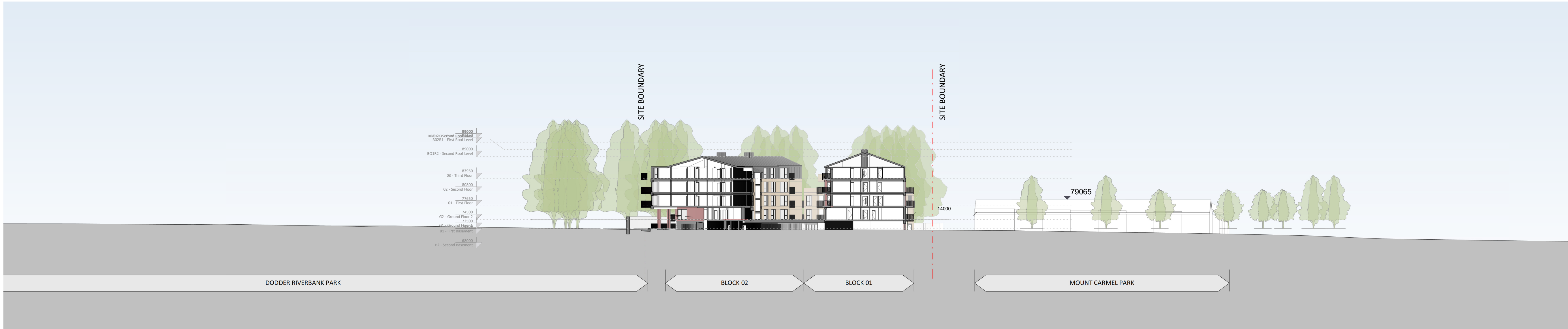
③ Section 3 - Contiguous Section North 1 : 500