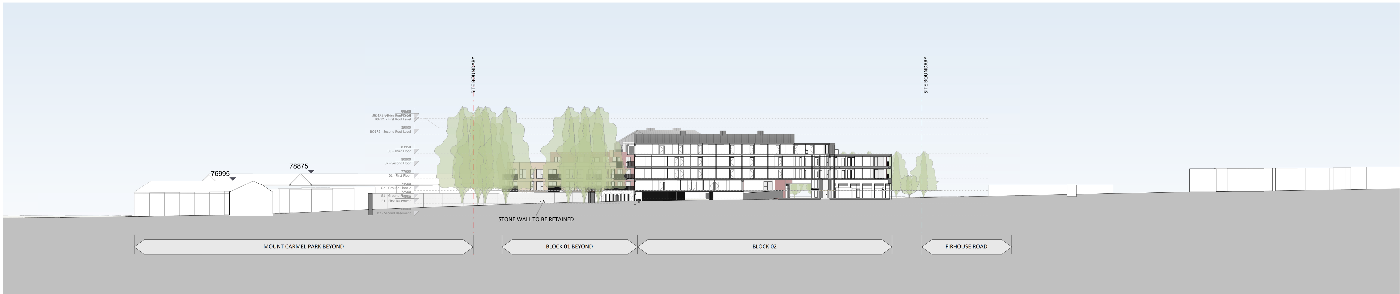
④ Section 4 - Contiguous Section East 1 : 500