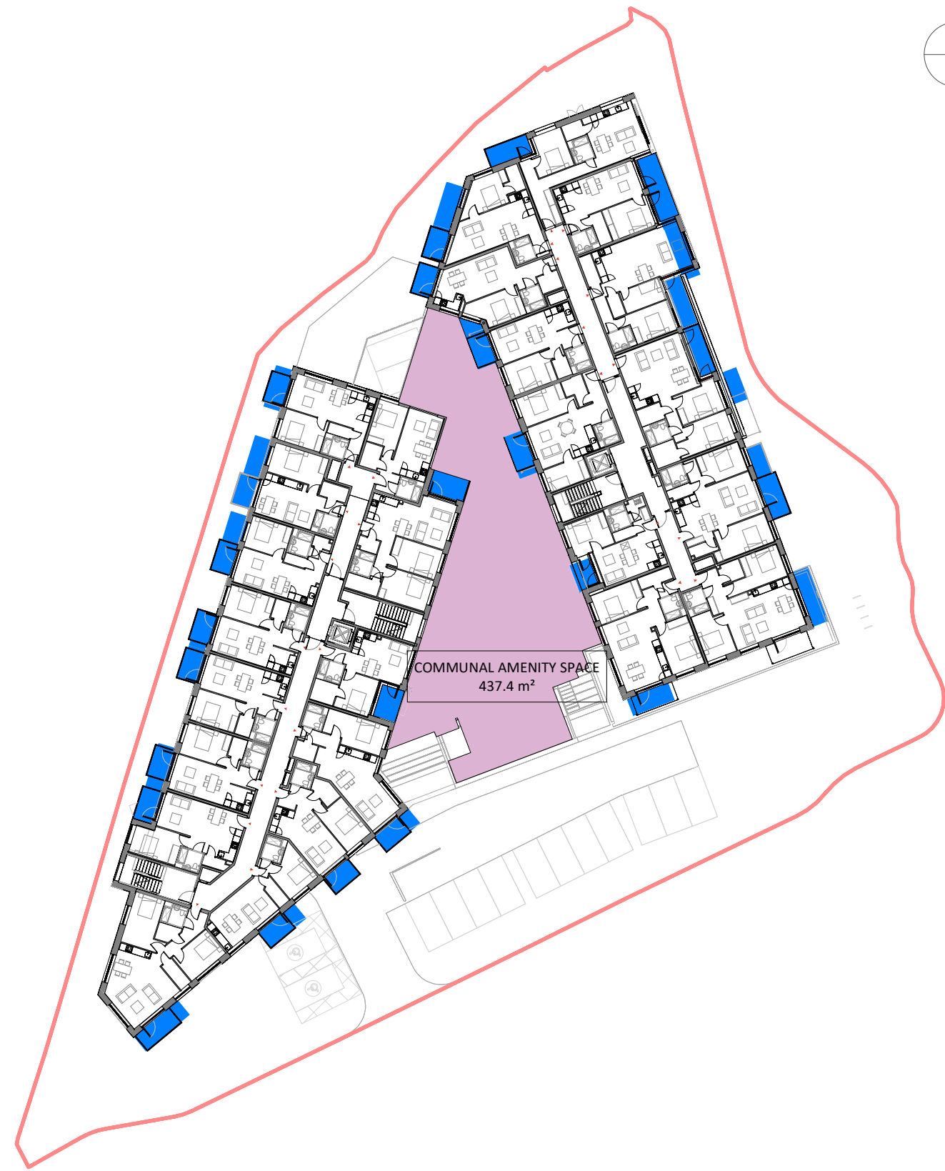
1 O1 - Quantum Open Space 1 : 500