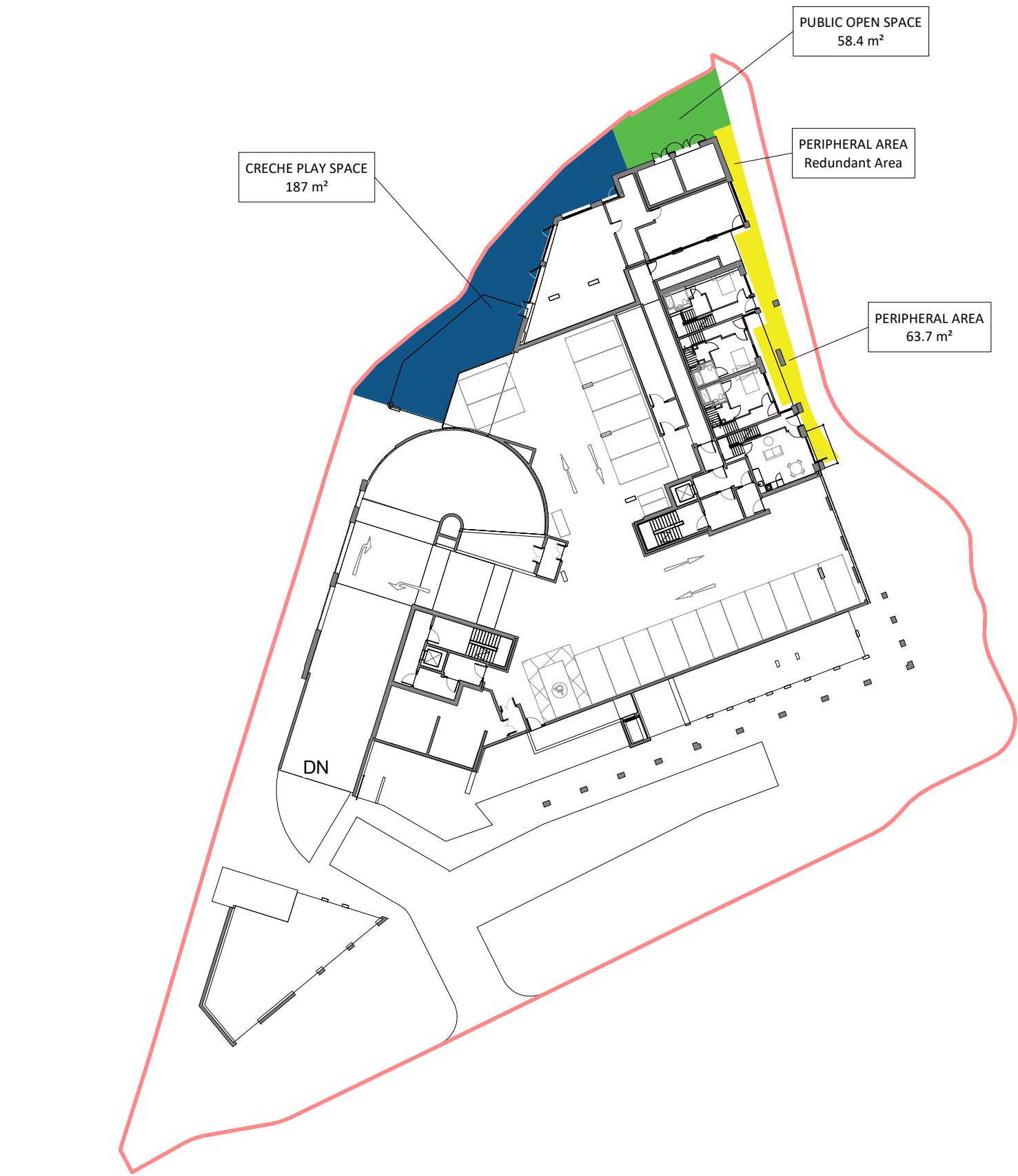
7 B1 - Quantum Open Space 1 : 500