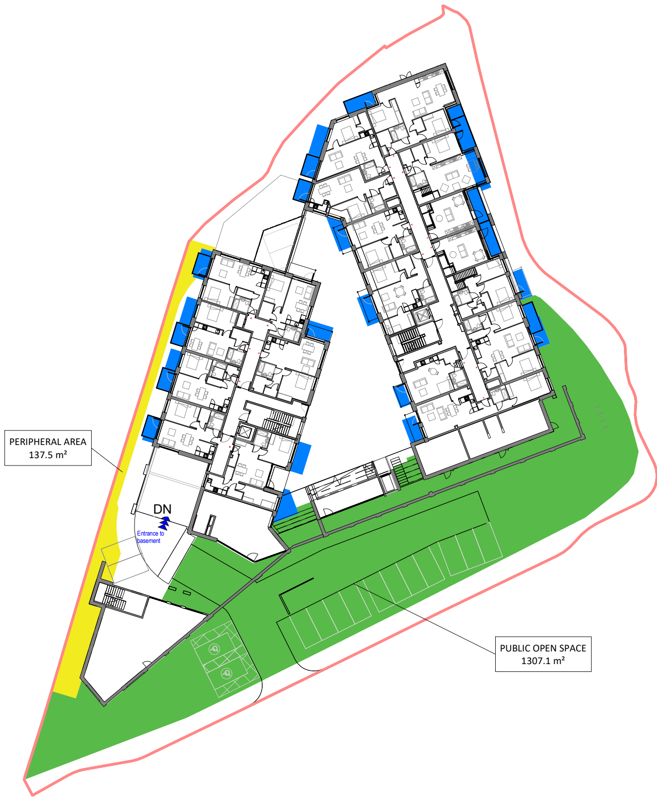
2 G2 - Quantum Open Space 1 : 500