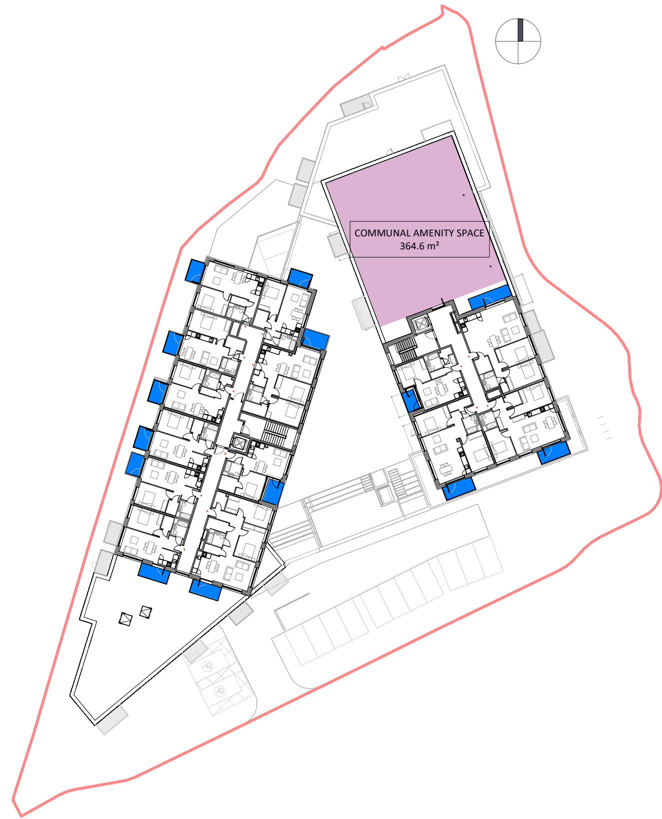
5 O3 - Quantum Open Space 1 : 500