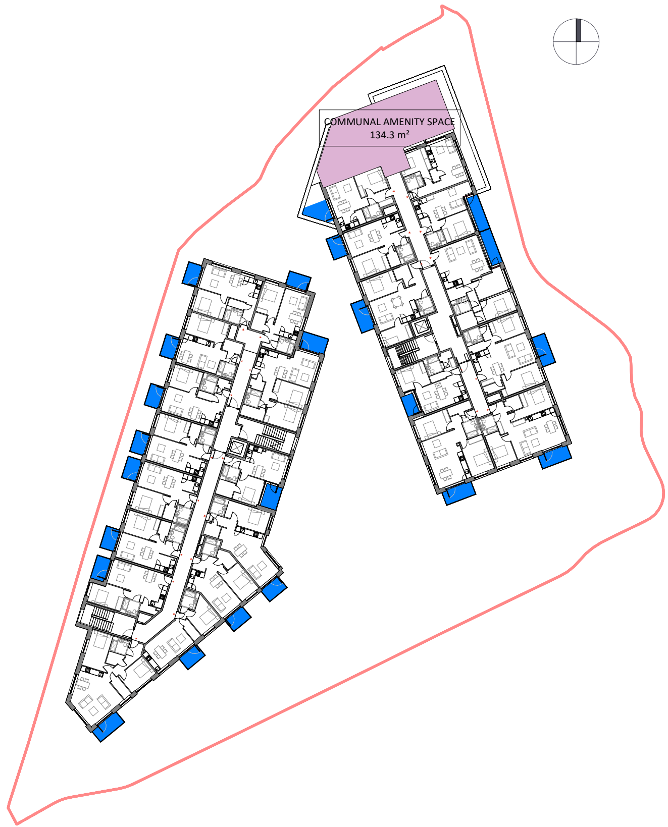
3 O2 - Quantum Open Space 1 : 500