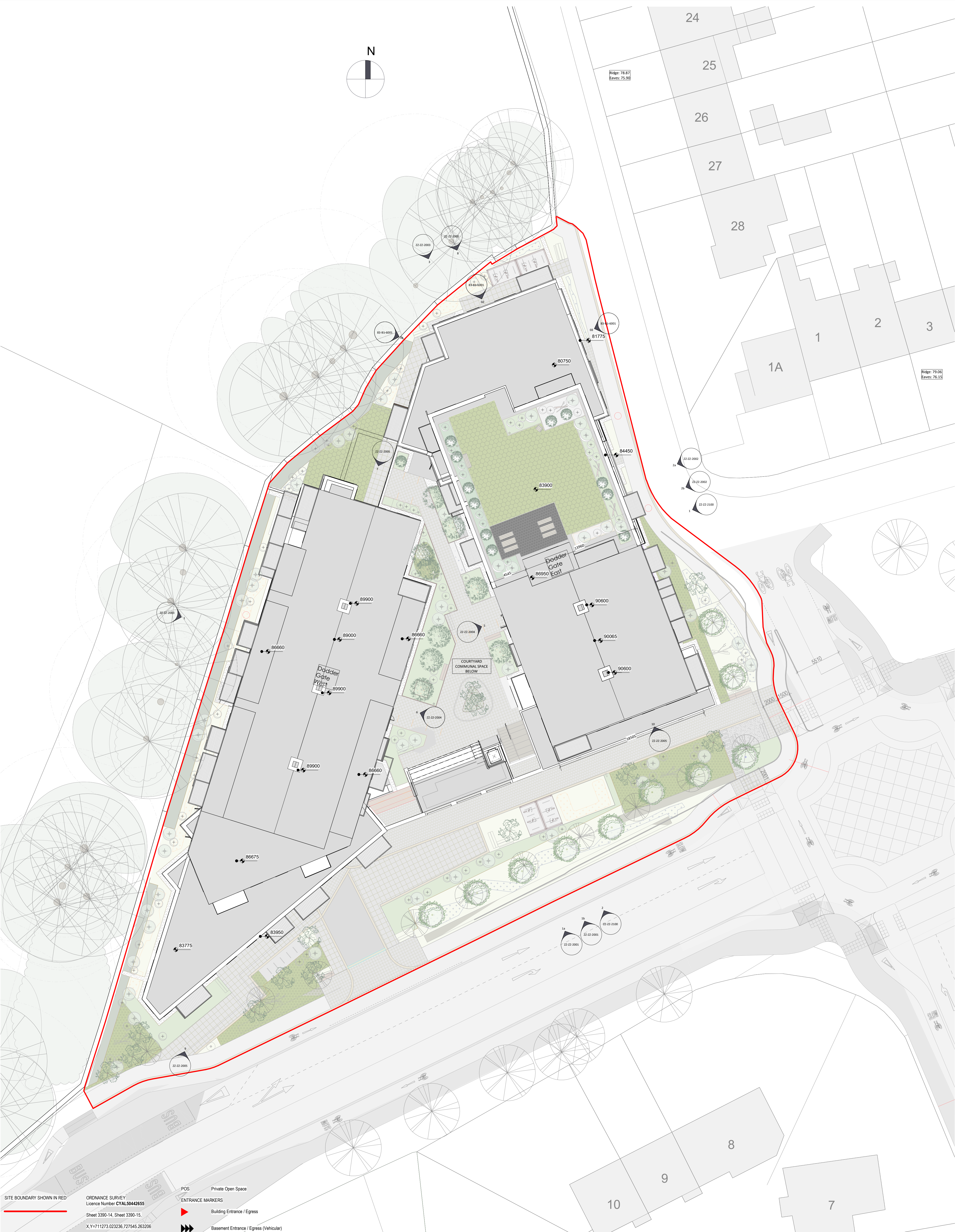
Permitted GA Plan - Roof Level