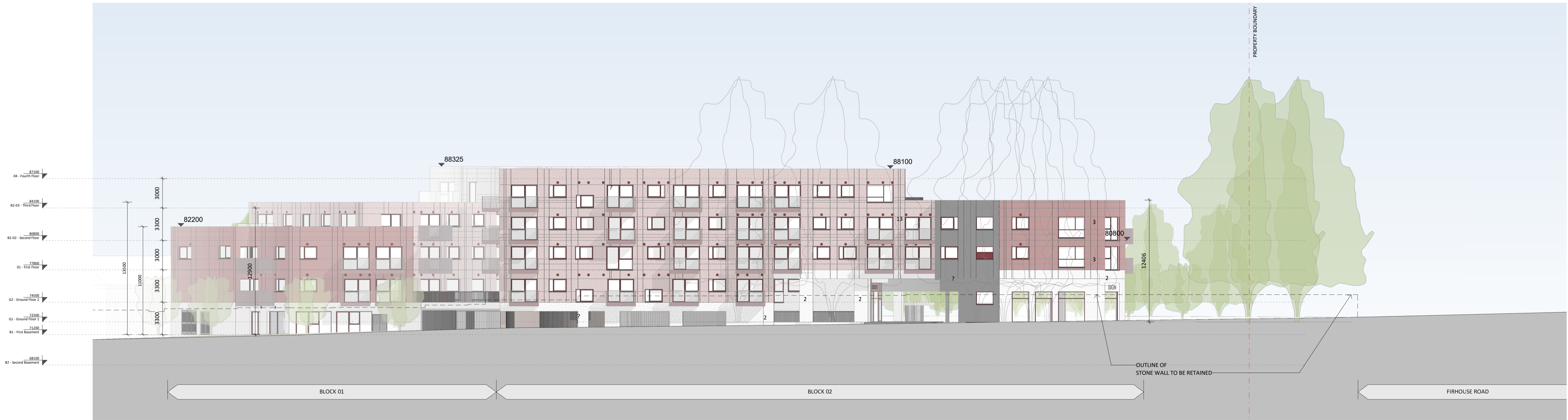
1 Proposed Elevation 03 - West Elevation 1 : 200