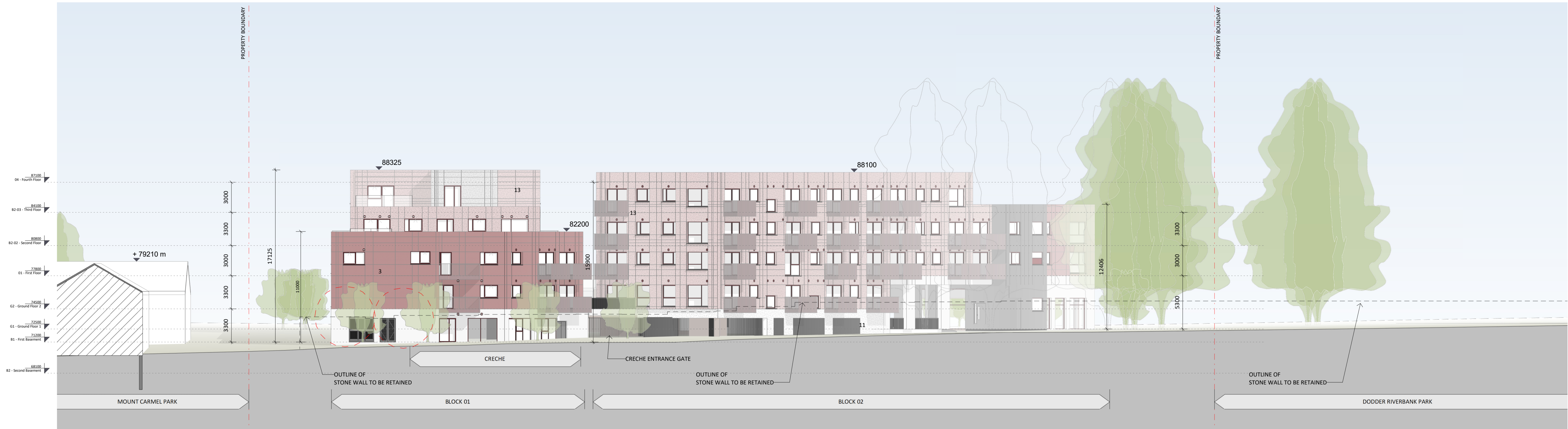
3 Proposed Elevation 03 - North Elevation 1 : 200