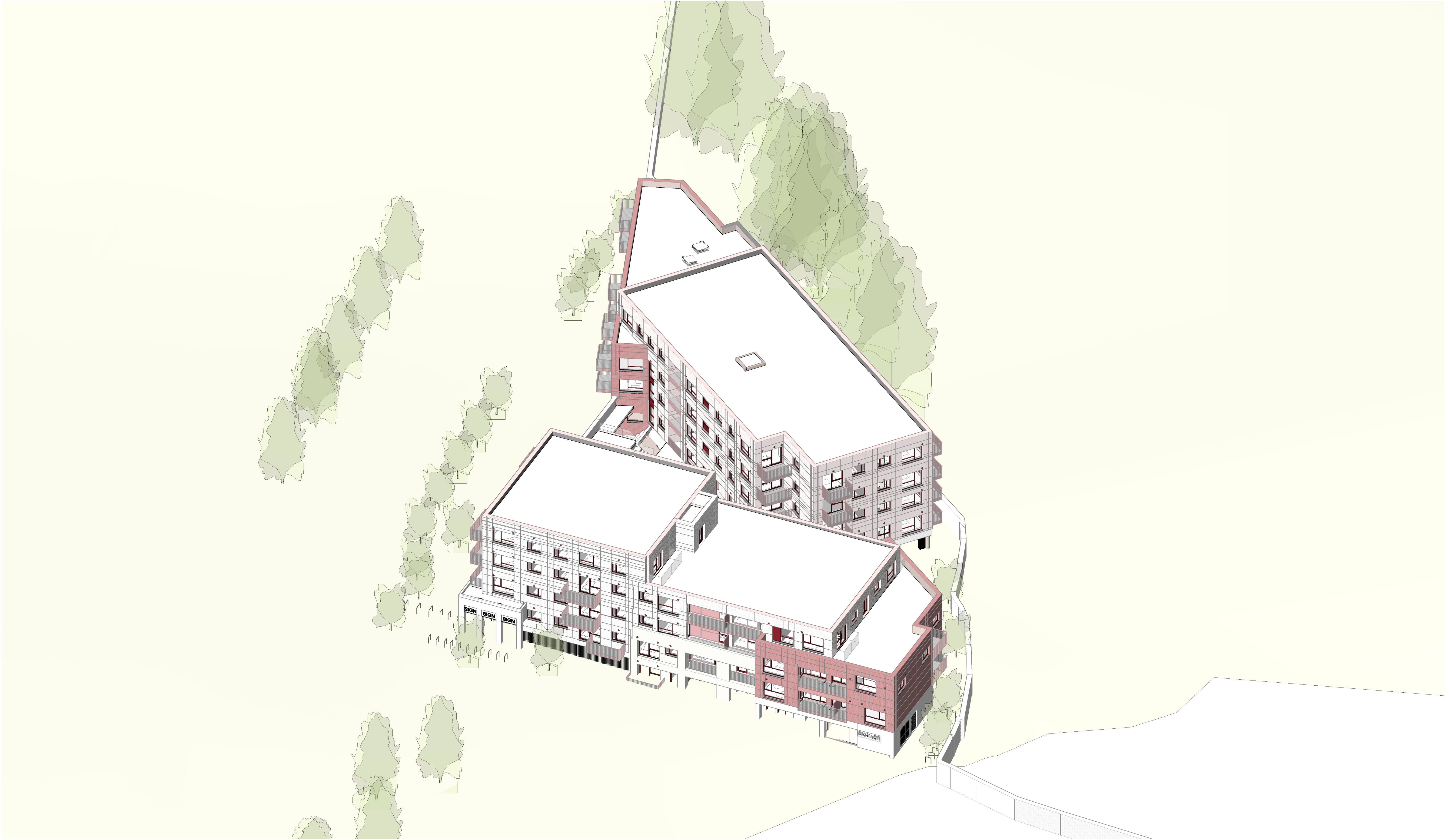
Proposed 3D View - North East