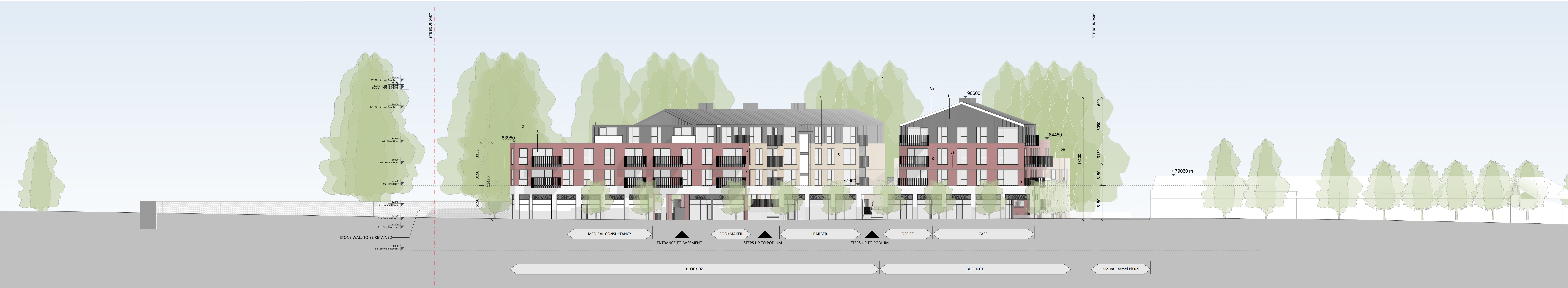
Contiguous Proposed Elevation 01 - Firhouse Road (South)