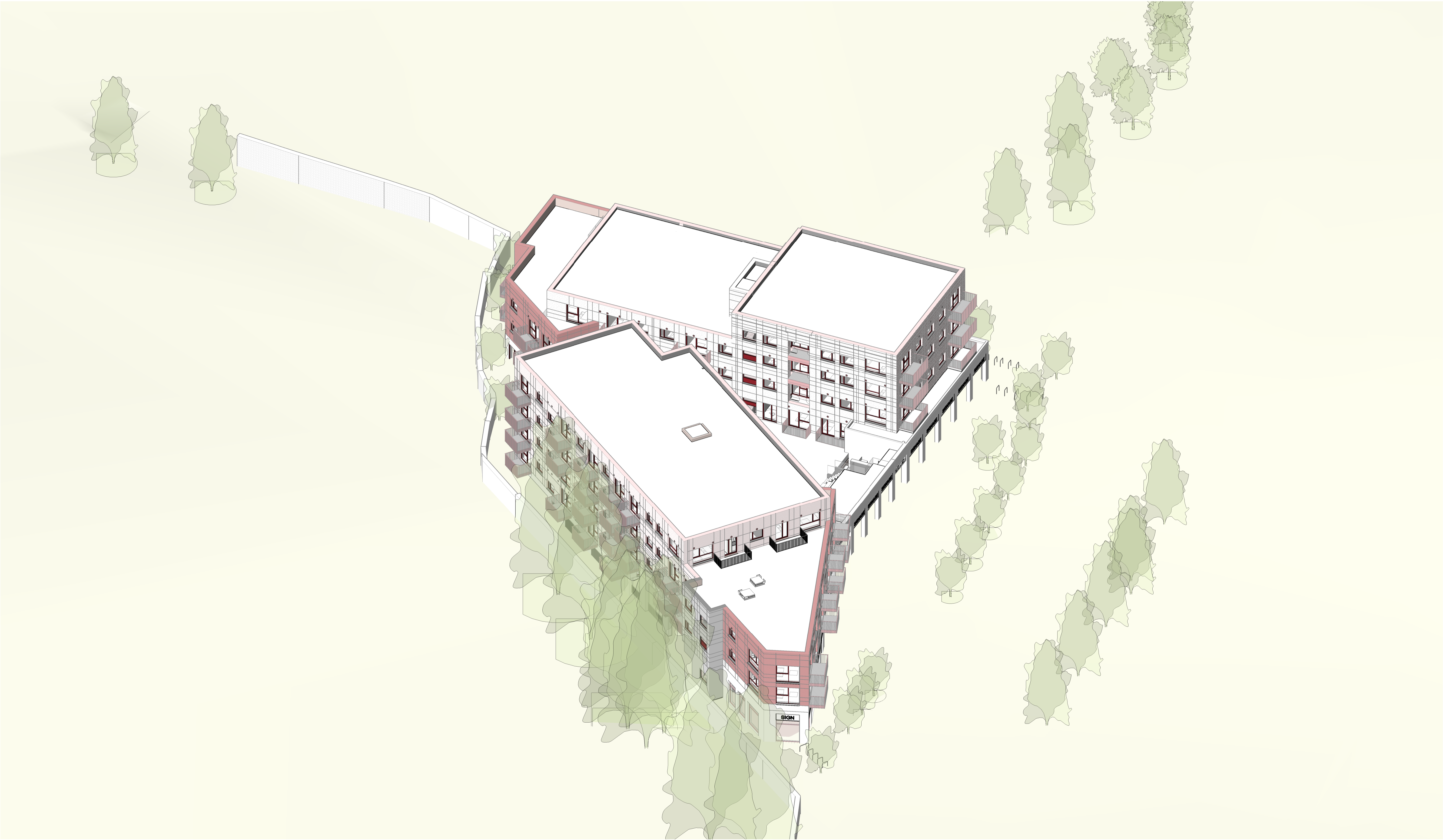
Proposed 3D View - South West