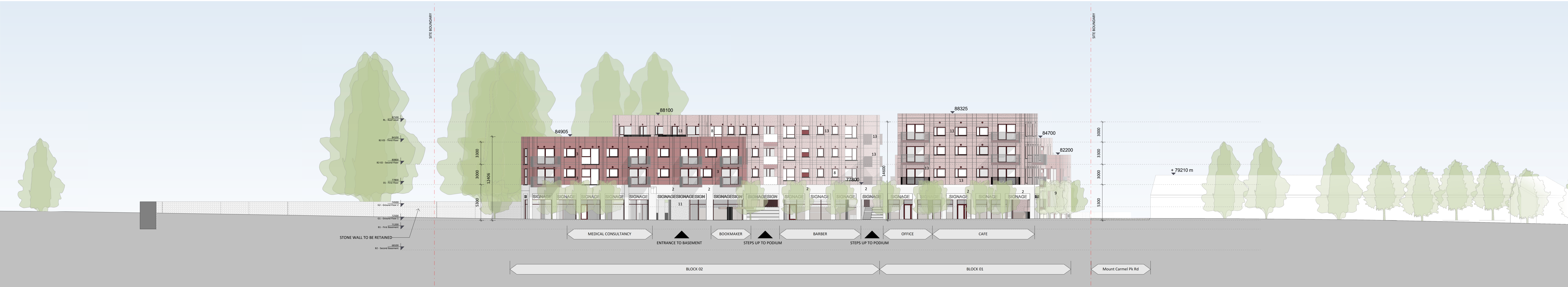
Contiguous Proposed Elevation 01 - Firhouse Road (South) 1:200